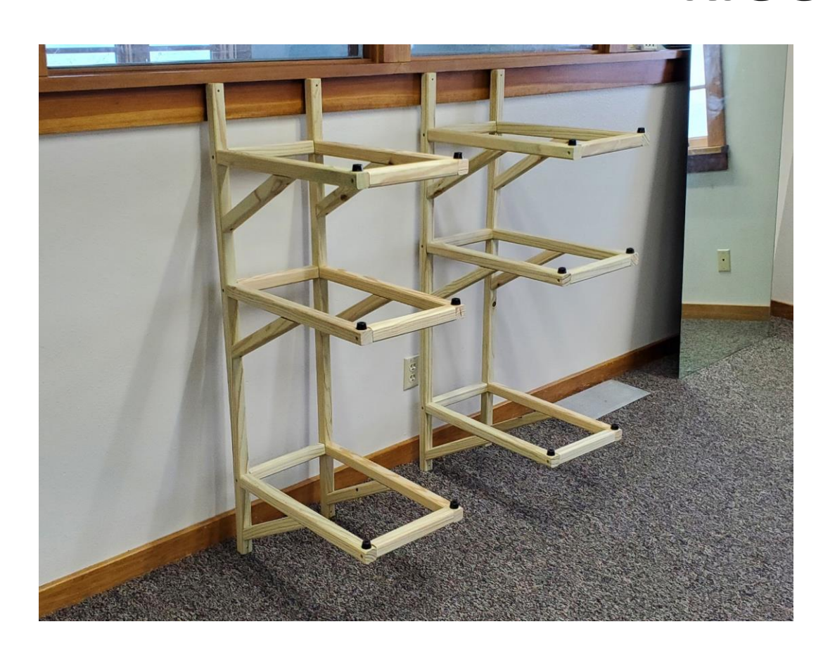
TEMPORARY LOCATION (YOGA ROOM)